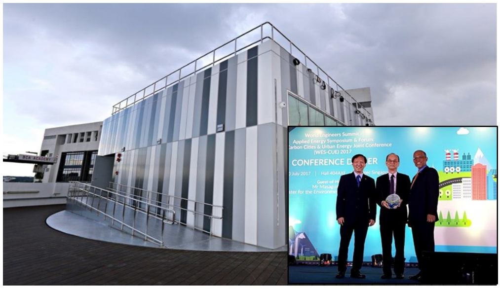
BCA SkyLab Wins IES Prestigious Engineering Achievement Award (20 July 2017)

Most of the attendees expressed their willingness to support PE/ZE/SLEB, although many challenges were identified from the group discussion, such as the lack of knowledge on PE-ZE-SLEB concept and lack of demonstration examples. To realize PE-ZE-SLEB, energy efficient technologies and cost-effective renewable solutions should be further developed and driven towards market adoption through RD&D. With technological advancement and cost reduction projection, PE-ZE-SLEB would be technologically and economically viable for mainstream adoption in the long term.